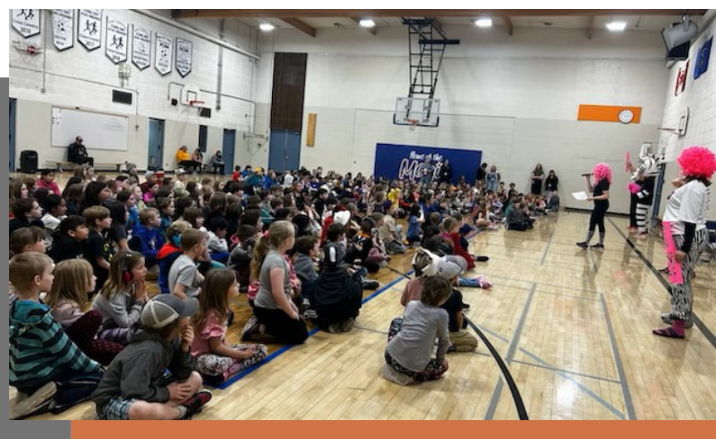
Our Run Wild Pep Rally