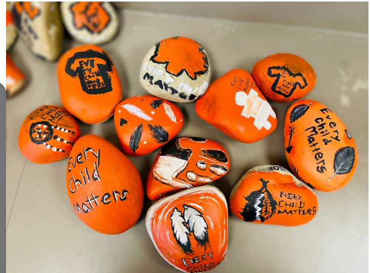
Reflection Rocks from the ÉMHS Walk for Truth and Reconciliation